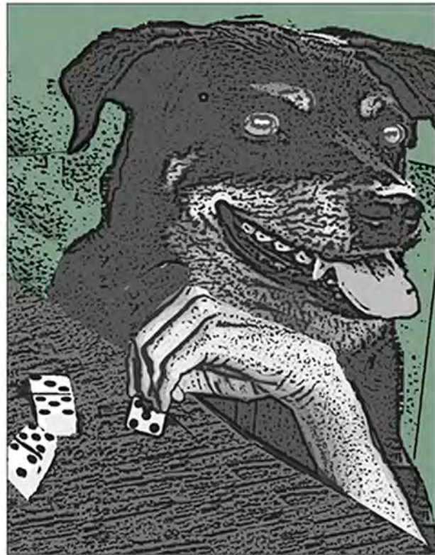
Sweet Pea sits in on the last hand of the game.