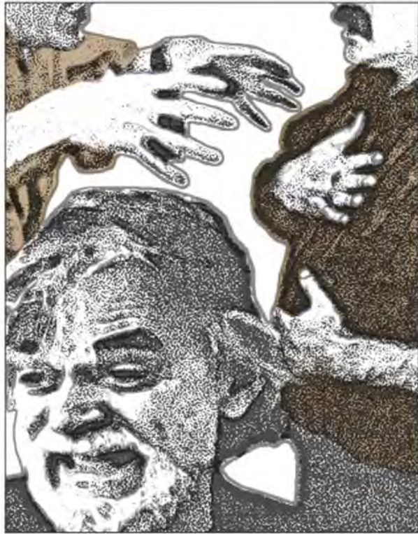
Lizard blamed Julio. Julio blamed Big Billy. Billy blamed...