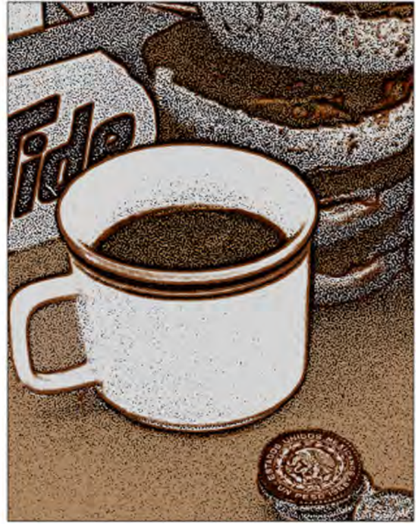
The Suds N' Dunk laundromat ran on pesos.